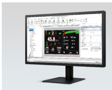
MTA Studio running on a PC