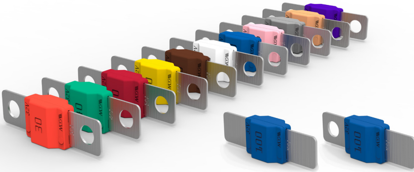
Clined version available